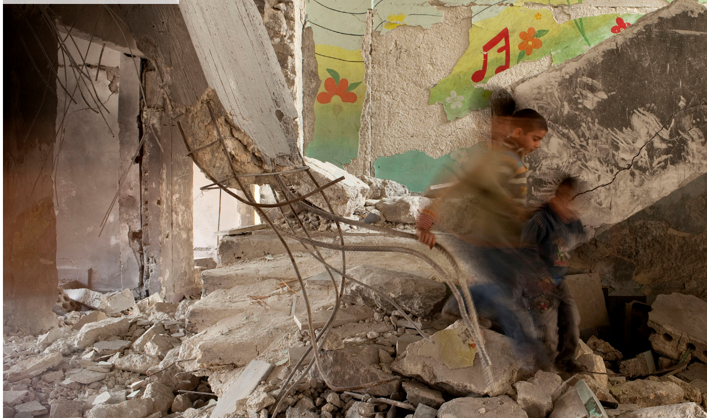
Aleppo, Syria February 9, 2013. Tarik Al Bab primary school closed and damaged by fighting.

These reflections were prepared from: a review of key documents and internal correspondence from the SSD consultation process; data on universalization; and informal conversations with some individuals centrally involved in the SSD's conception, agreement and subsequent efforts around it, including reflections provided at an informal meeting in Geneva to discuss these issues in June 2019. 2 Article 36 thanks all individuals for the insights used here, but takes responsibility for the content of this paper. This paper does not represent a comprehensive account of the SSD process, but is intended rather to provide some key reflections from Article 36's perspective and based on our work on this issue, from the point of view of looking ahead to future work.