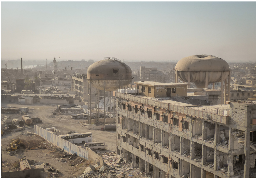
A view of part of the Al-Shifa complex in 2017

During the last phase of the conflict with ISIS, the group used the Al-Shifa hospital complex in West Mosul as its headquarters. The complex is located on the right (West) bank of the river Tigris adjacent to the Old City, where the final stages of the conflict took place. As documented elsewhere, 45 the damage sustained to West Mosul and the Old City in particular by the final offensive was immense. 46 This damage came primarily from the heavy use of explosive weapons including airstrikes, artillery and rocket barrages by forces allied with the Iraqi government, as well as the use of improvised explosive weapons by ISIS. One clearance operator working in the Old City area after the conflict informally estimated that around two fifths of the resulting unexploded ordnance and remnants to clear were from ISIS, and three fifths from liberating forces.