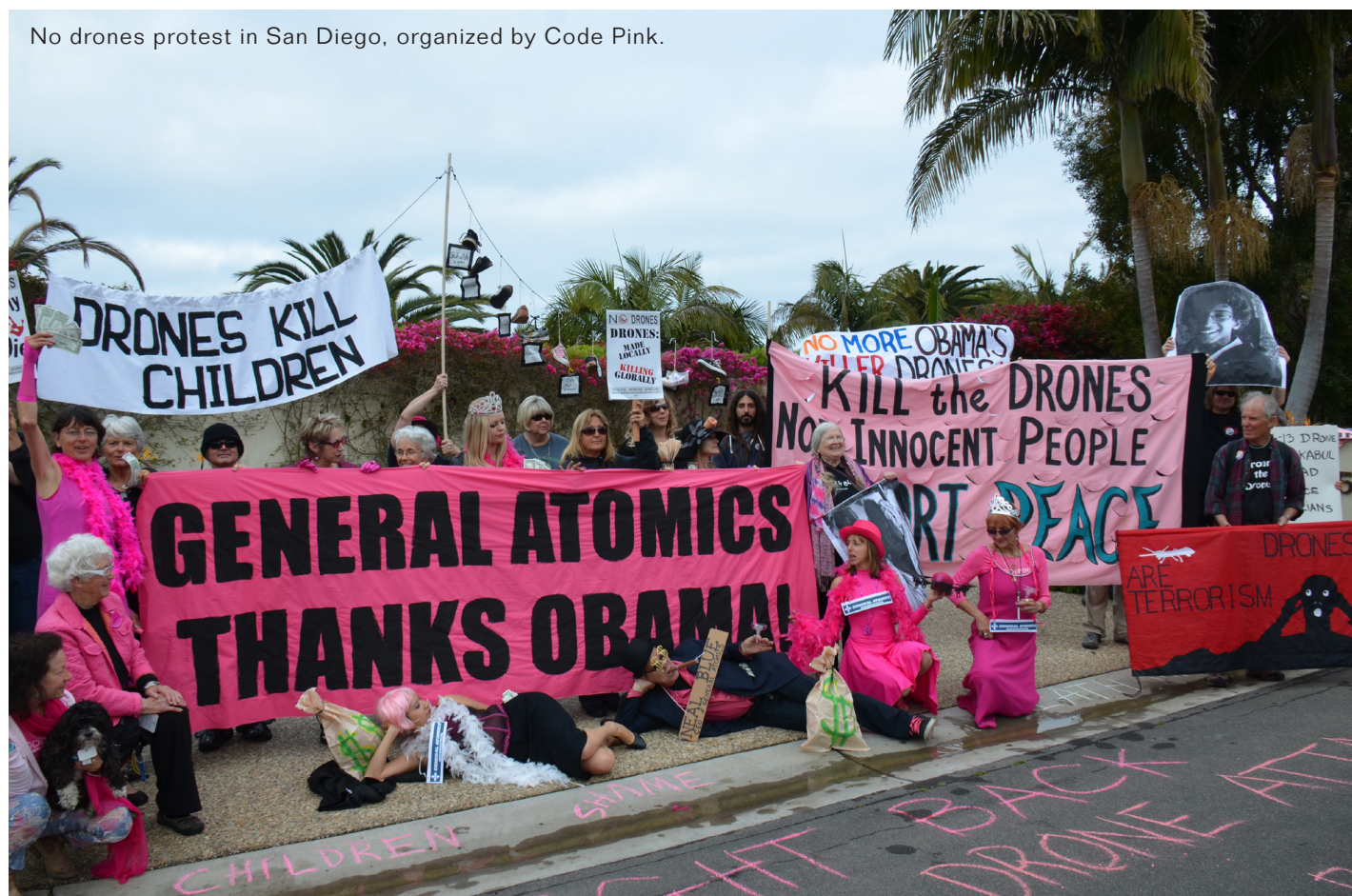
No drones protest in San Diego, organized by Code Pink.