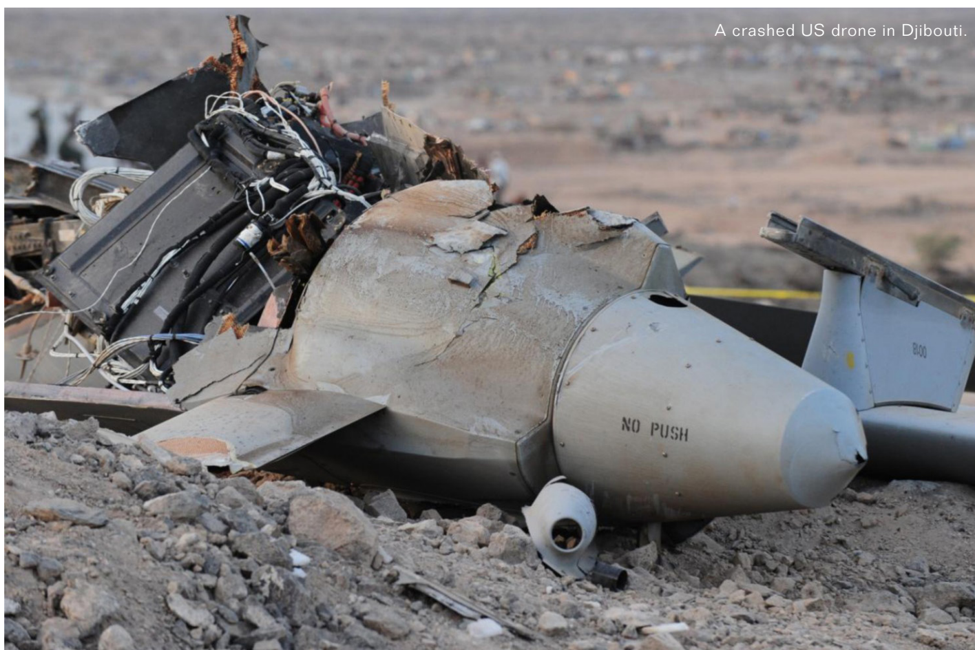
A crashed US drone in Djibouti.