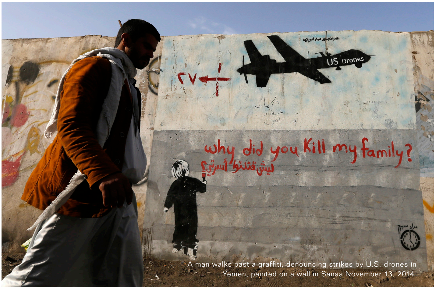
A man walks past a graffiti, denouncing strikes by U.S. drones in Yemen, painted on a wall in Sanaa November 13, 2014.