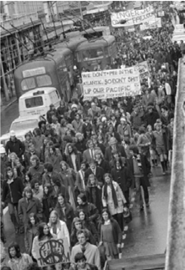
Protest march against French nuclear testing in the Pacific, Wellington, New Zealand, 1972.

Rejecting nuclear explosions Even though it has not entered into force, the CTBT represents a clear international standard rejecting nuclear explosions. It is important in building confidence in global, technical means of verification and monitoring, which will be necessary ultimately, to nuclear weapon elimination. Furthermore, it strengthens the stigma against nuclear weapons and contributes to their delegitimation. It is likely that any resumption of nuclear testing by nuclear-armed states will continue to be met with widespread public disquiet and international condemnation.