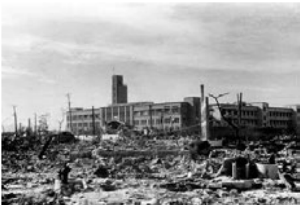
Hiroshima Red Cross Hospital. 6 October 1945.

Given the precarious situation of the 925 million people who are presently malnourished, even a small decline in available food and rise in prices will have devastating consequences. Famine on a major scale would lead to epidemics of infectious diseases. Massive population displacements, political tensions and conflict over scarce resources, and possibly a breakdown of social order should also be expected.