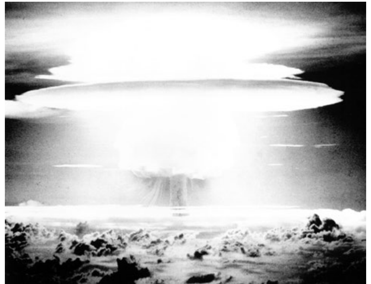
A 15-megaton thermonuclear explosion at Bikini Atoll in the Marshall Islands in 1954.

The Comprehensive Test Ban Treaty was adopted in 1996 but has not yet entered into force. As of February 2013, 158 states are parties to the treaty and 25 more are signatories, but have not yet ratified the treaty. The provisions of the treaty require a particular group of countries with nuclear reactors to ratify before it can enter into force. Of these, China, Egypt, Iran, Israel and the US have signed but not ratified and India, North Korea and Pakistan have not signed. The Comprehensive Test Ban Treaty Organisation exists to monitor compliance with the treaty around the world. The Soviet Union last tested nuclear weapons in 1990, the UK in 1991, the US in 1992, and China and France in 1996. The most recent known nuclear tests by India and Pakistan were in 1998. A test by North Korea in February 2013 was again met with widespread international condemnation, including from the United Nations Security Council.