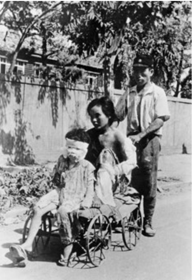
Survivors of the Hiroshima bomb who have received some medical care. 12 August 1945, Hiroshima, Japan.

In addition to the EMP, the ionized fireball has the ability to block radio and radar signals for seconds to minutes over an area tens of kilometres across. High frequency radio can be disrupted over hundreds of kilometres for minutes to hours under certain conditions.