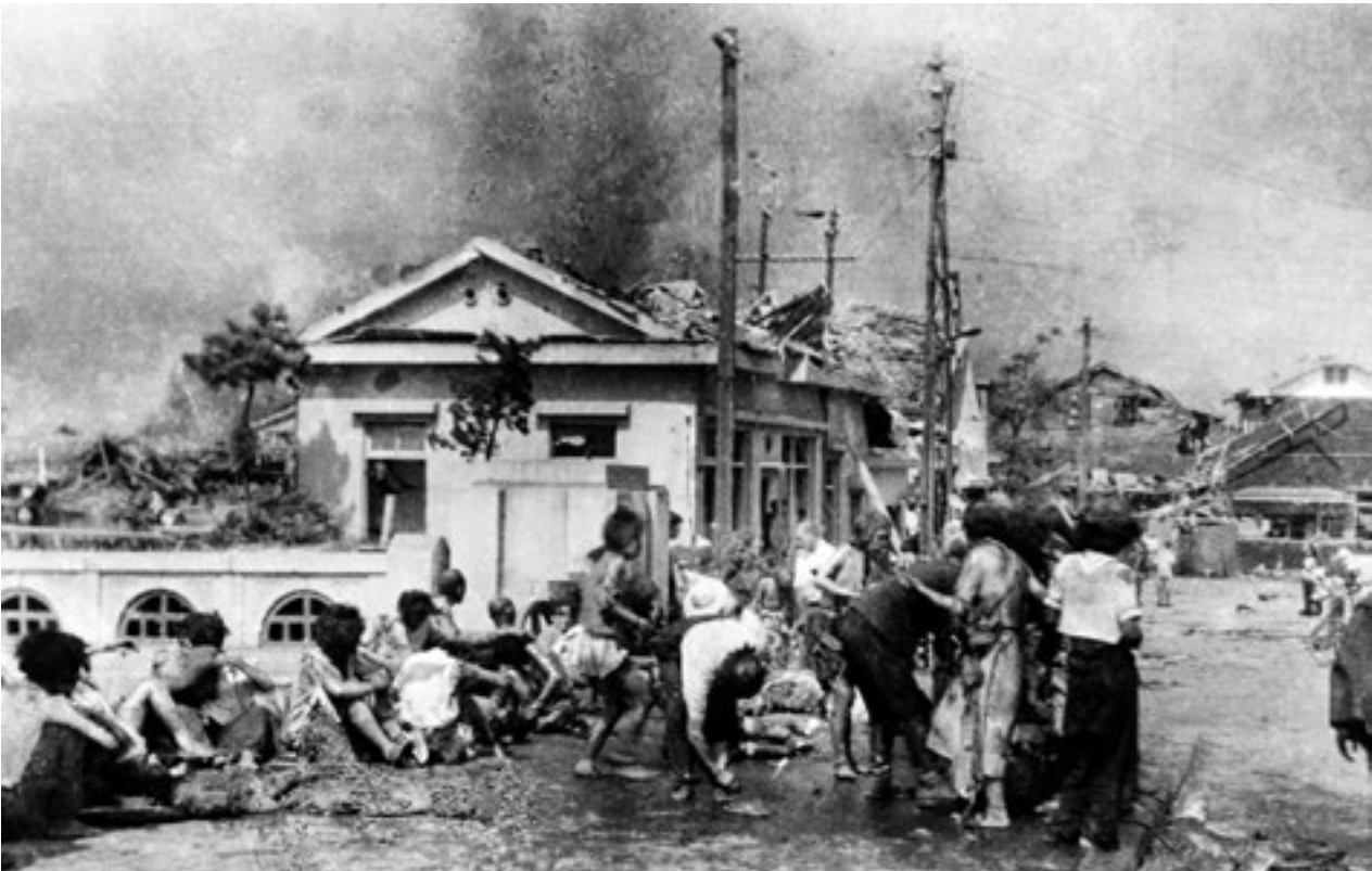
Injured civilians, having escaped the raging inferno, gathered on a pavement west of Miyuki-bashi about 11.00 am on 6 August 1945. 6 August 1945, Hiroshima, Japan.

A nuclear explosion involves the sudden release of massive amounts of energy resulting from an instantaneous fusion or fission process. This explosion can be many orders of magnitude more powerful than the largest conventional detonations. Immediately following the explosion, the most significant effects are blast, thermal radiation (light, heat) and ionising radiation.